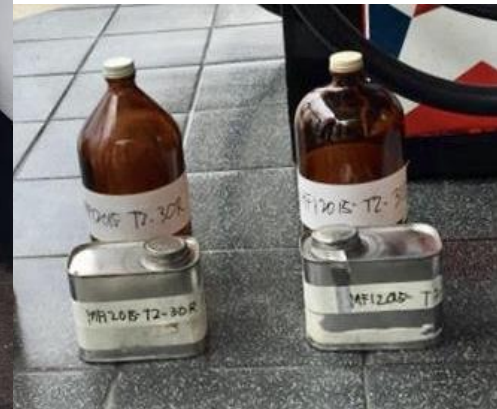
Sample retention by RO