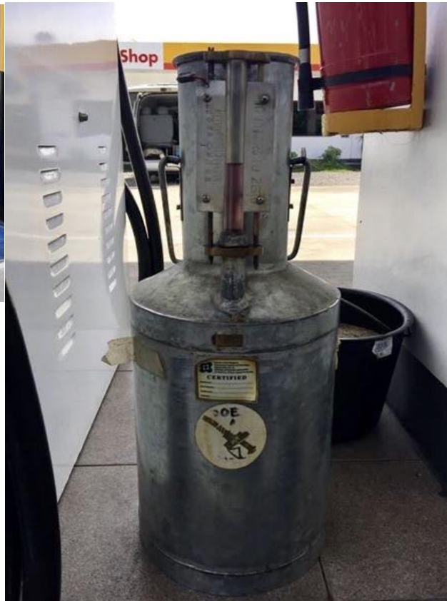
ITDI-calibrated Test Measure