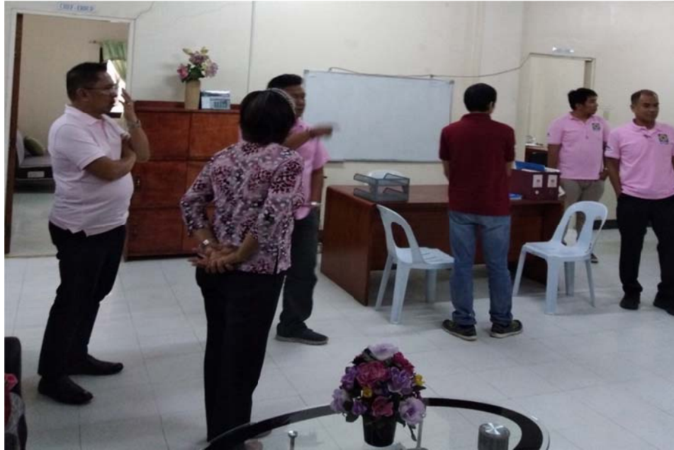
The office space of VFO is spacious with a very comfortable lounge for visitors