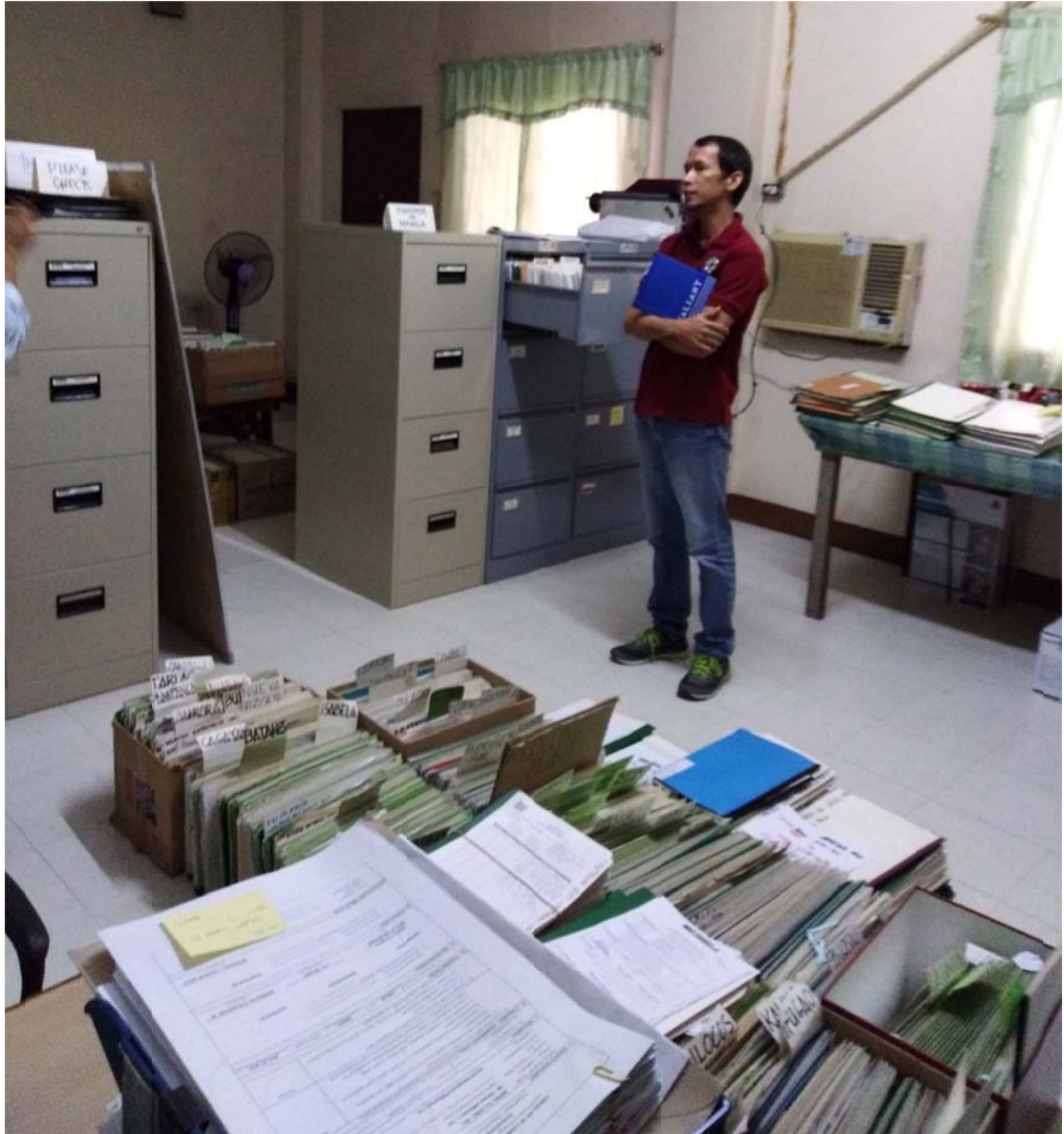
Piles of documents in boxes on the floor due to limited filing cabinets for records keeping.