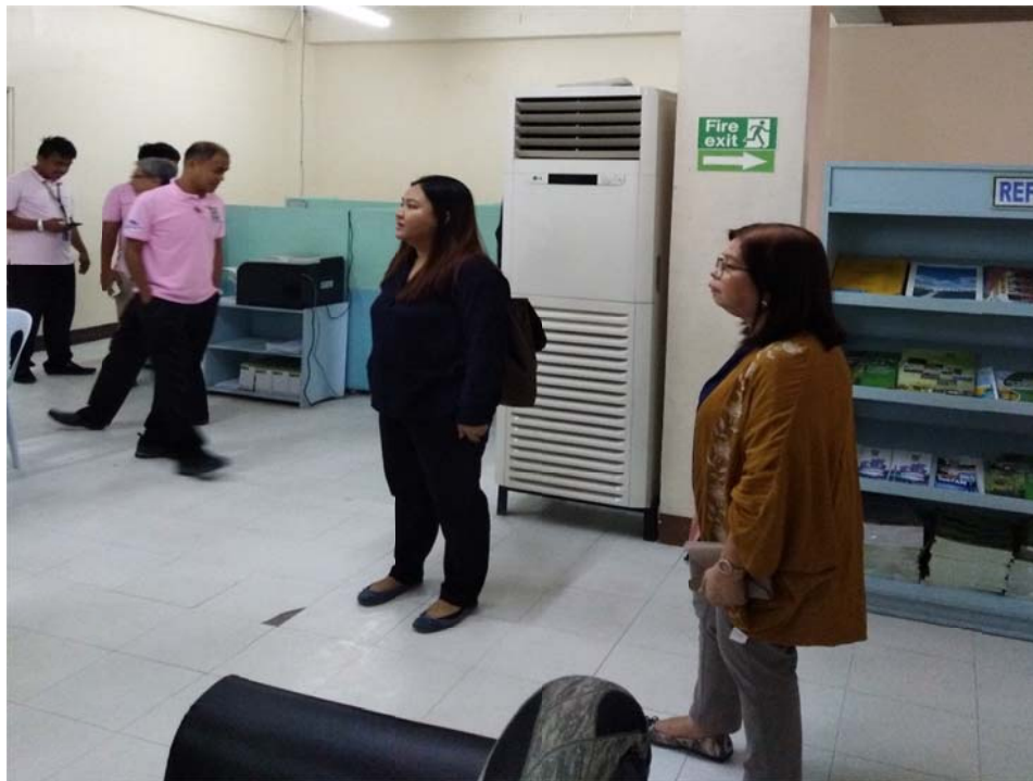
In view of the limited availability of modulars, the VFO installed additional cubicles in cutom made, painted in green for a conducive work space of staff