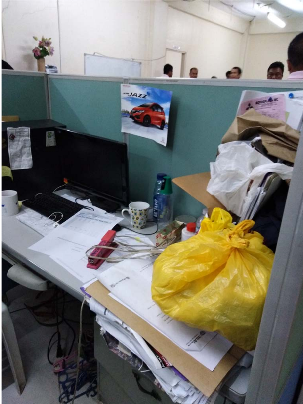
This table need to do 5S