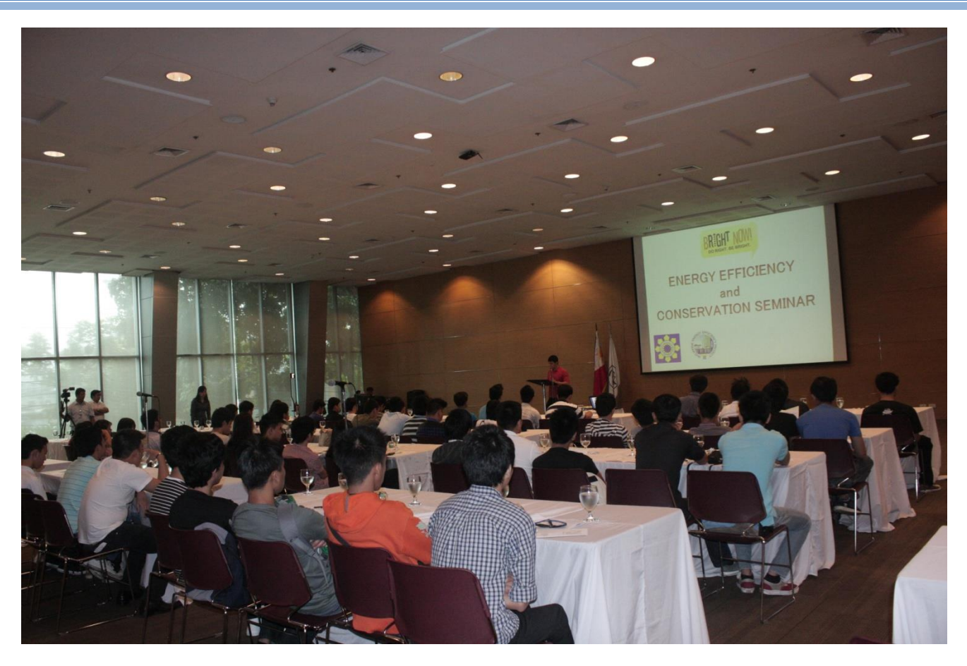
Right to consumer education