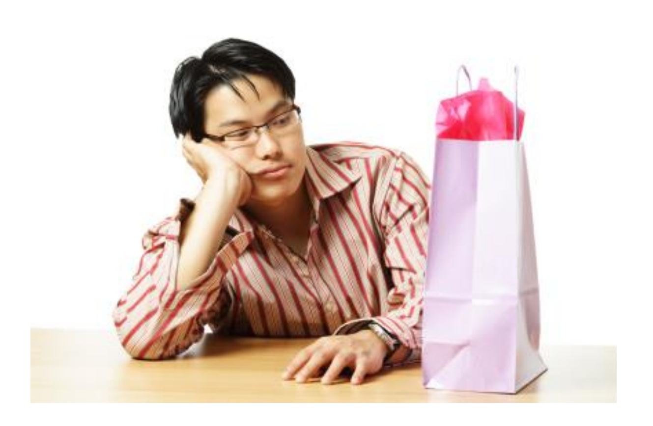
Right to redress